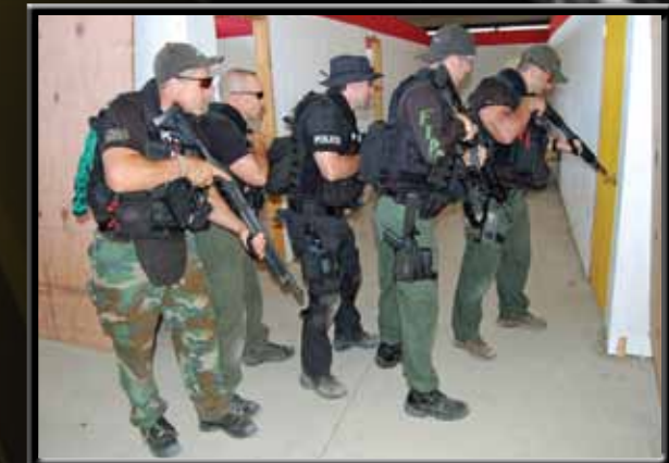
Stacked for entry, this S.W.A.T. team practices proper breaching methods. Special loads help operators take care of door locks and hinges without collateral damage.